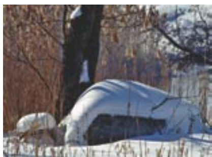
The mean temperature -4 - -6^{\circ}\text{C} . Rainfall average 25-70 mm.