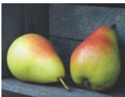
The mean temperature +6 – +8°C. Rainfall average 40-70 mm.