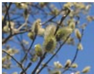
△ In the springtime