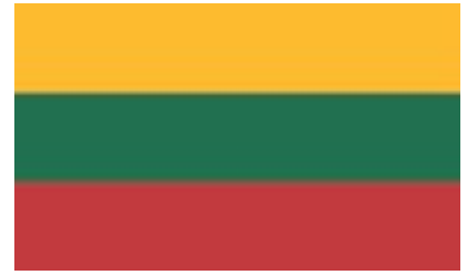
△ The national flag of Lithuania

The Republic of Lithuania is one of the countries belonging to the Baltic States region, situated in the geographical centre of Europe, along the southeastern shore of the Baltic Sea. Lithuania shares its sea and land borders with Latvia, one more country belonging to the Baltic States region (the length of the border 610 km), Poland (the length of the border 677 km), Belarus (the length of the border 677 km), and the Russian exclave of the Kaliningrad Oblast (the length of the border 285 km). The total length of the borders is 1,732 km.