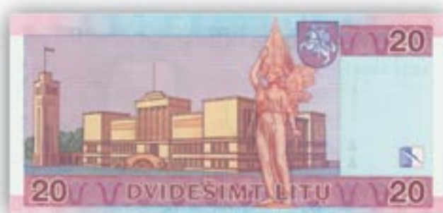
20 litas banknote

Averse: a portrait of priest Maironis (Jonas Mačiulis, 1862–1932), famous Lithuanian poet and bard of the Lithuanian national rebirth.