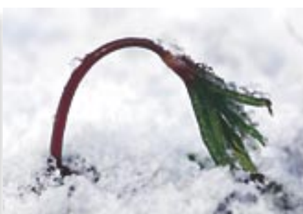
The mean temperature -3 - -6^{\circ}\text{C} . Rainfall average 20-50 mm.