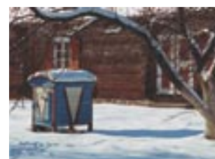
△ Winter in the Open Air Museum of Lithuania in Rumšiškės

Though winters are quite mild in Lithuania, during every winter there are at least a few days, when the thermometer drops below -25°C. And during every winter such tricks of the weather cause damage to the lovers of exotic plants. Snow is seen now and then in Lithuania, so sledging is most popular in January and February, though steady snow cover often prevails until the middle of March. Usual thickness of snow is 25–35 cm, but it is always thin in the Pamarys region. Roads are often in the icy conditions in winter mornings; snow coating often makes the roads slippery and difficult to get through, so it is complicated to drive in wintertime. Special winter tyres are obligatory from November 10 th to April 1 st .