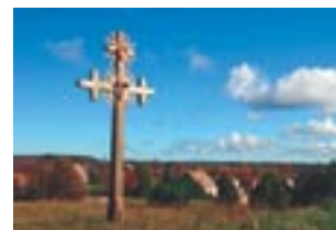
△ Samogitia was the last to convert to Christianity (in 1413–1417); cross in Žemaitija National Park