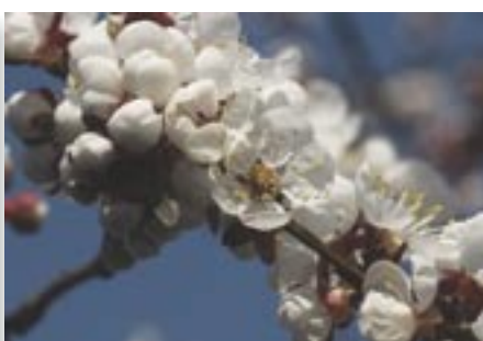
The mean temperature +12 – +14°C. Rainfall average 40-70 mm.