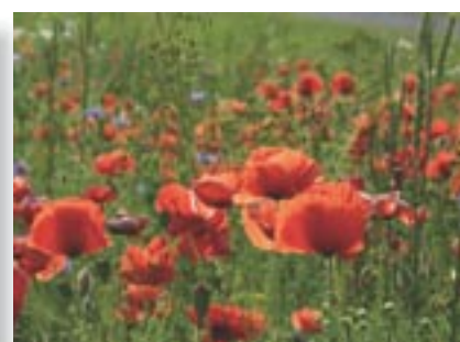
The mean temperature +14 – +16°C. Rainfall average 45-80 mm.