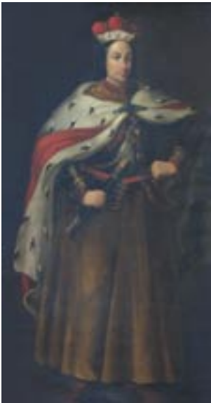
△ Grand Duke Vytautas the Great is the most favourite ruler of Lithuania (his reign 1392–1430), painting in the Kaunas Cathedral Basilica

The first people arrived to the territory of present Lithuania in the 11 th –9 th millennium BC. Sedentary people – farmers, the ancestors of Balts – appeared somewhere in the 3 rd millennium BC. The ancient Balts were outstanding for their corded ware pottery, special form of axes, unique fortification system of mounds. The Balts were farmers. They cultivated cereal and gardens. The first cultivated plants included wheat, barley, millets. The Balts ate game, fish, berries and mushrooms.