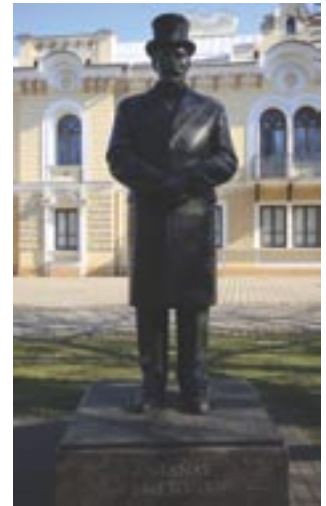
△ The first President of Lithuania Antanas Smetona

2004 – Lithuania becomes a NATO member and joins the European Union.