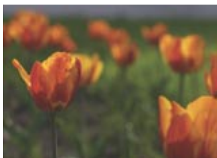
The mean temperature +5 – +7°C. Rainfall average 33-50 mm.