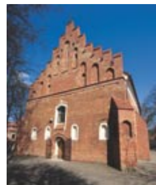
△ St. Nicholas Church is considered the oldest extant sacral brick building in Lithuania

1569 – in order to avoid the increasing influence of Russia, by the Lublian Union Lithuania and Poland replace the union of two countries with the Polish-Lithuanian Commonwealth. The Commonwealth is ruled by a single elected monarch, governed with a common parliament (the Sejm) and share common foreign policy.