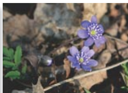
The mean temperature -0,7^{\circ}\text{C} . Rainfall average 30-40 mm.