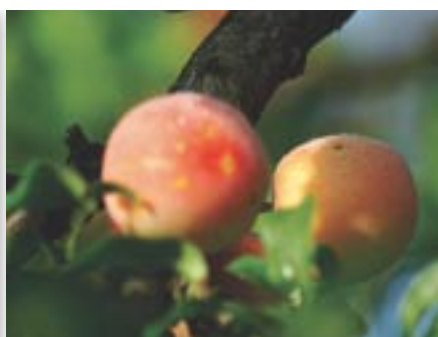
The mean temperature +16,2^{\circ}\text{C} . Rainfall average 70-80 mm.