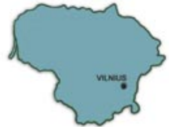
△ Lithuania in its shape is similar to a man's profile

Vilnius is the capital and the largest city of Lithuania. The republic is ruled by the President, the Seimas ( the Parliament ) and the Government. Lithuania is a parliamentary republic by the type of government. Constitution is the main law of the country.