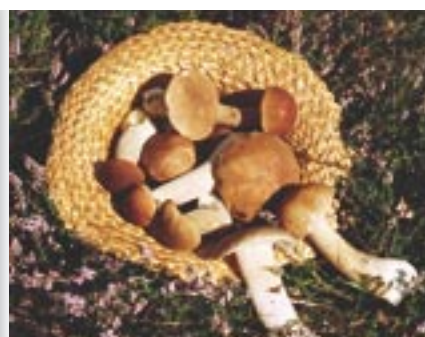
The mean temperature +11,9^{\circ}\text{C} . Rainfall average 50-100 mm.