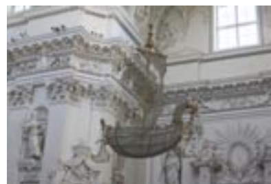
Baroque epoch in Lithuania (1569–1795)