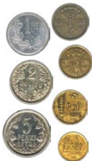
△ Lithuanian coins in 1925