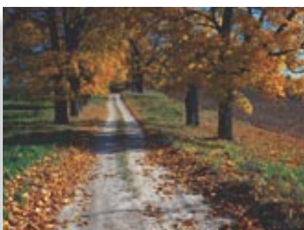
The mean temperature +1 – -5°C. Rainfall average 40-95 mm.