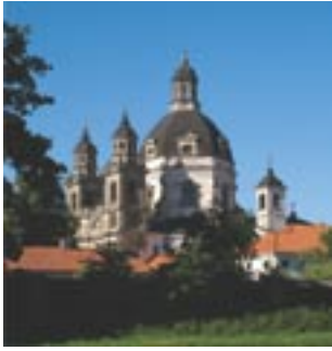
△ Pažaislis Monastery was closed after 1863–1864 uprising against the Russian government