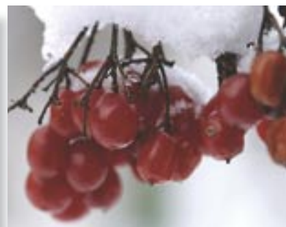
The mean temperature -2 – -4°C. Rainfall average 30-70 mm.