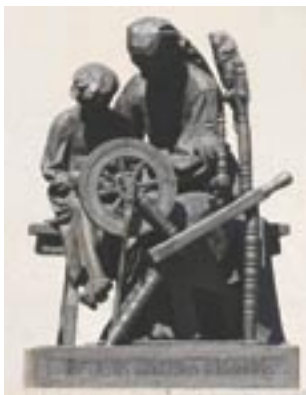
△ Lithuania School during press banning, sculpture (by Petras Rimša, 1941)