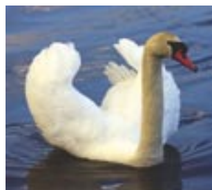
△ Swan in the Galvė Lake

The climate in Lithuania is transitional between maritime and continental, damp both in winter and summer. The Lithuanian climate is mainly influenced by the Atlantic Ocean and the Gulf Stream. Weather conditions seem to be unstable throughout a year. The average annual temperature is about +6.2^{\circ}\text{C} . Statistically, the difference between the warmest month (July) and the coldest month (January) is 21.8^{\circ}\text{C} .