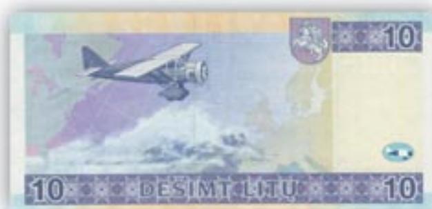
10 litas banknote

Averse: a double portrait of pilots S. Darius and S. Girėnas, national heroes of Lithuania, who have flown over the Atlantic Ocean.